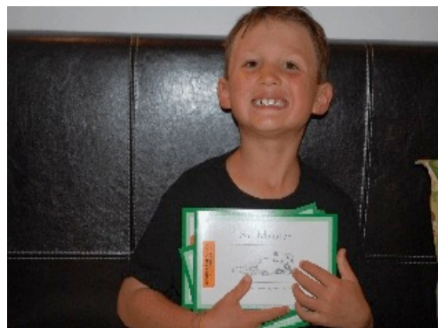
An excited early reader at home with the books

Both the Library and the Elementary School are in the "reading business" so it's only natural for us to