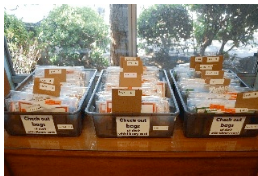
Early reader books ready for check out.