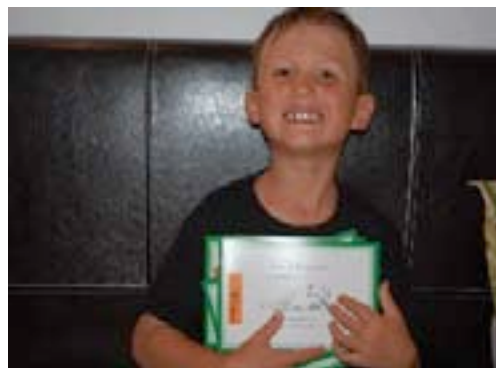
An excited early reader at home with the books

Both the Library and the Elementary School are in the "reading business" so it's only natural for us to