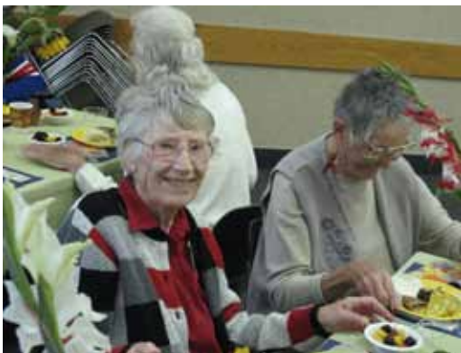
Friends of the Library Volunteer Recognition Brunch April 30, 2008.